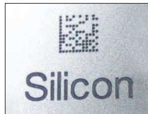
Solar and Semiconductor